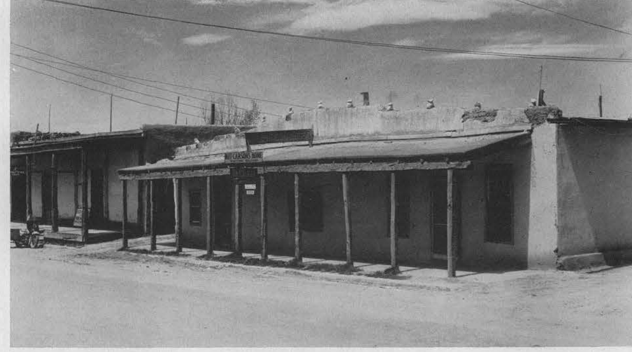
KIT CARSON'S HOUSE in Taos was once the center tive forays against warring Indian tribes in the fronand headquarters for Army scouting parties, and punitier southwest.

Ranchos de Taos, on the other hand, is a handful of irrigated valley farms where Pueblo braves and squaws till the chili plants, corn and